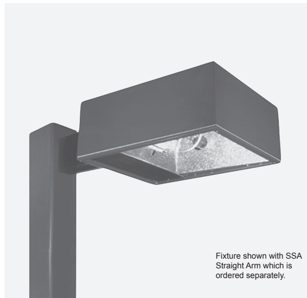
Fixture shown with SSA Straight Arm which is ordered separately.