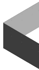
S93 2 Sided CORNER Shield