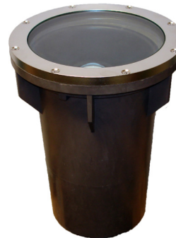
Shown with TDB4-RG-SS Stainless Steel Ring