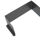
SI37 - 3 Sided Shield