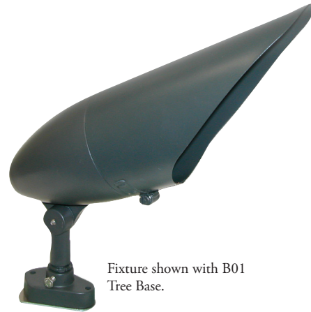
Fixture shown with B01 Tree Base.