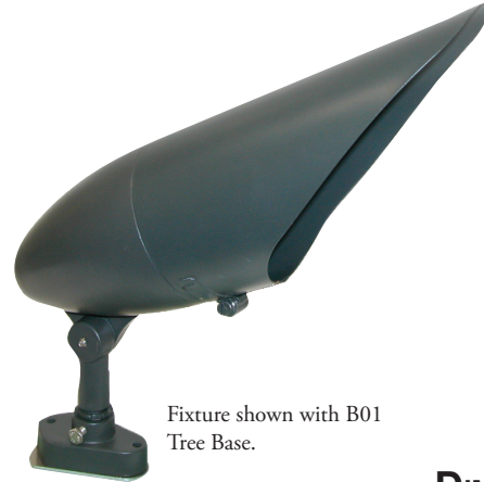
Fixture shown with B01 Tree Base.