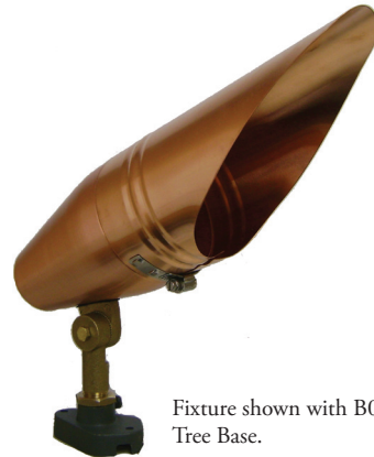
Fixture shown with B06 Tree Base.