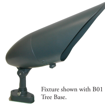
Fixture shown with B01 Tree Base.